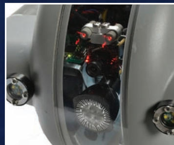
> Laser Profiling