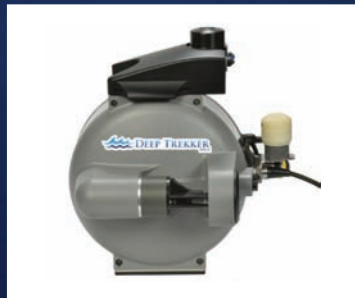
> Sonar Profiling