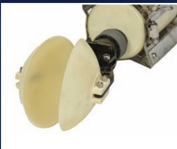
> Sediment Sampling