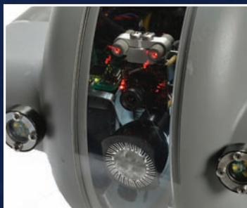
> Laser Profiling