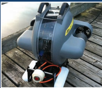
> Ultrasonic Thickness