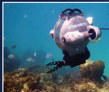
> Grabber Arm