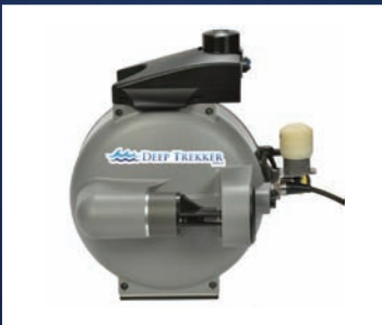
> Sonar Profiling